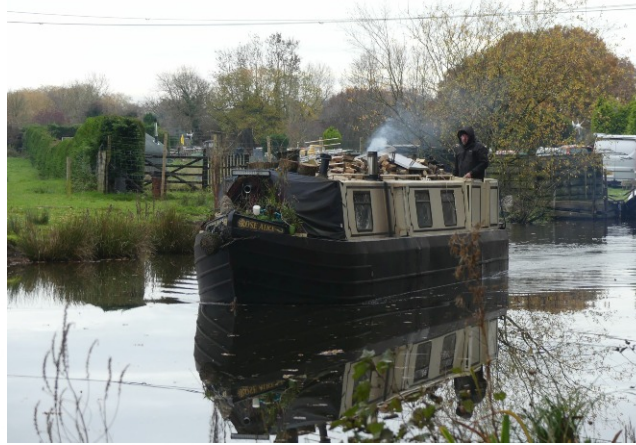
The Macclesfield Canal was built in the 1820s, at the end of the Canal Age, as railways were starting to take over, and hence had a relatively short working life. It runs from Marple to Hall Green near Kidsgrove.