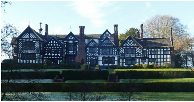
Bramall Hall dates back to the 14th century and was owned by the Davenport family. The house and gardens are open to the public.